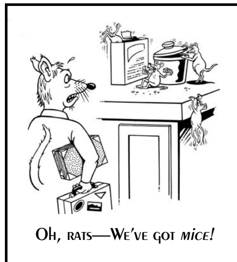
OH, RATS—WE'VE GOT MICE!

Our regular treatments help control these pests living around your foundation. Meanwhile, you can help by keeping the areas around the foundation free of clutter and wood piles. Keep ground covers and vines away from your foundation, and keep your roof gutters cleaned out. Don't leave pet food out overnight, as that can be an additional food source for cockroaches.